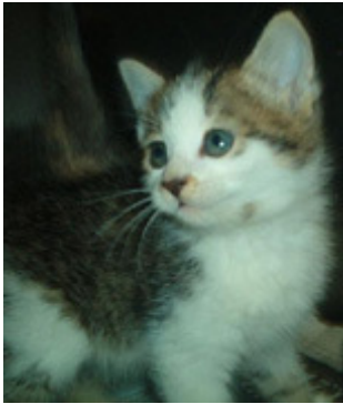
#212 Sugar-Sponsored (at GloMarr) Domestic Short Hair - gray and white

"My name is Sugar and I'm one of four little kittens brought to the shelter by my a lady who lived in the house where we were born. Our momma was a stray and she had us there. We stayed there for a while but it's gettin cold and we'd all be much better off if we could find safe indoor homes...and families of our own." UPDATE: SUGAR CAN NOW BE SEEN AT THE HUMANE SOCIETY'S KENNEL SPACE AT GLO-MARR PET STORE, LOCATED ON LINCOLN STREET. Thank you to Hawkins Construction, who sponsored a portion of Sugar's adoption fee. Now she can go home at a reduced rate!