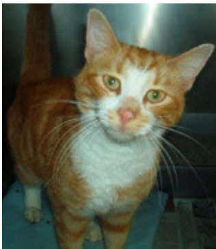
#267 Charity-Sponsored (at Shelter) Domestic Short Hair - orange and white