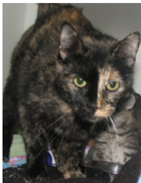
#3248 Lacey-Tortoiseshell (Sponsored)