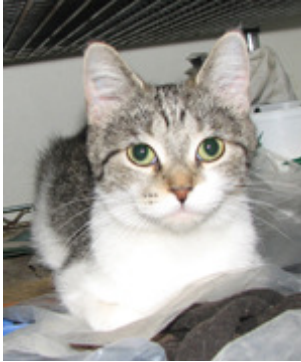
#273 Zoey-Domestic Short Hair (Sponsored)

'Hi there. My name is Zoey and I'm one of the many, many kitties at the shelter who are up for adoption. I had hoped my owner would come get me, but they never showed up. I'm a great kitty...I'm less than a year old.' Thank you to an anonymous donor, who sponsored a portion of Zoey's adoption fee. Now she can go home at a reduced rate!