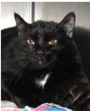
#202 Princess-Domestic Short Hair-black (Declawed and Sponsored)

'Hello. My name is Princess and I'm big, black, and beautiful! I'm not your everyday housecat, by any means. I'm a big girl and I just know if you'd come meet me that you'd love every little ounce of me! I'm declawed and housebroken too, so that's always a plus. Won't you come see me and visit for a while?' Thank you to an anonymous donor, who sponsored a portion of Princess's adoption fee. Now she can go home at a reduced rate!