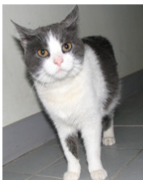
#97 Clay-Domestic Short Hair-gray (Sponsored)

'Hello. My name is Clay and I was a stray kitty from down in Stringtown before I came to the animal shelter. I know I look kinda bad right now. I must have gotten beat up a little along the way. I'm kinda scared, but I know I'll come out of my shell soon and be ready to have visitors. I hope you'll make a quick trip out to see me cause I really think you'd like me.' Thank you to an anonymous donor, who sponsored a portion of Clay's adoption fee. Now he can go home at a reduced rate!