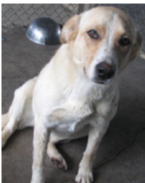
#247 Paige-Sponsored (Labrador Retriever Mixed )

'Hi. My name is Paige and I'm a lab mix of some sort that was picked up down on Lick Skillet Road. That was back on March 27th and my owner still hasn't come to get me. I had hoped they'd show up and take me back home. If they don't come for me by April 3rd, I'll be up for adoption.' Thank you to an anonymous donor, who sponsored a portion of Paige's adoption fee. Now she can go home at a reduced rate!