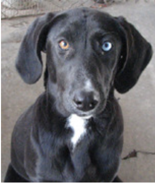
#271 Minnie-Sponsored (Black Labrador Retriever Mixed )

'Hi. My name is Minnie and I'm a black lab mix of some sort. I have one blue eye, so I might have some husky or Australian Shepherd in me. Who really knows? All that really matters is that I'm a really good dog who needs a really good family to come adopt me and take me home. So I hope you'll come see me and maybe decide to adopt me.' Thank you to an anonymous donor, who sponsored a portion of Minnie's adoption fee. Now she can go home at a reduced rate!