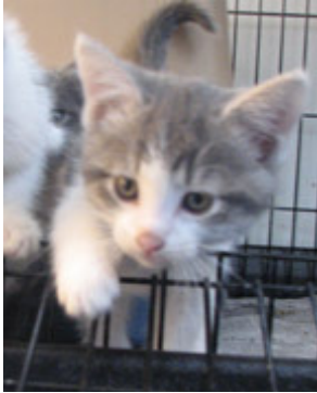
#212 Jo-Sponsored (Domestic Short Hair - gray and white)

"Hi. I'm Jo and I'm here with my momma and three siblings. We all came here a few weeks ago, but momma had to get us weaned before we could be adopted out. We're old enough now though that we can go home with our new families so I sure hope you'll come visit with us and maybe pick out one of us to take home with you." Thank you to an anonymous donor, who sponsored a portion of Jo's adoption fee. Now she can go home at a reduced rate!