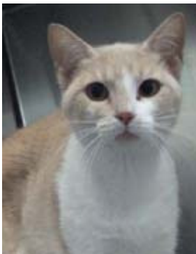
#232 Brandy-Sponsored (Domestic Short Hair - buff and white)