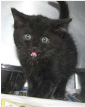
#271 Ziggy-Sponsored (Domestic Short Hair-black)