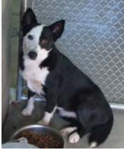
#230 Phoebe-Sponsored (Shepherd, Shetland Sheepdog Sheltie Mixed )

"Hello! My name is Phoebe, and I'd like to tell you more about myself. Although there's not much to tell. I was found on McDonald Road, all alone. They estimate my age at about four or five years. But that's all they know. Except I'm a sweet girl and very playful. I sure hope I get a home!" Thank you to an anonymous donor, who sponsored a portion of Phoebe's adoption fee. Now she can go home at a reduced rate!