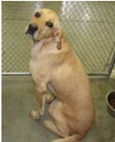
#220 Sarge-Sponsored (Yellow Labrador Retriever)

"Hey there! My name is Sarge. Well, not really. But I came in here as a stray so they don't know what my real name is. So they're just gonna call me Sarge for right now. They picked me up over on Indian Trail, where I had been for a couple of days. I'm less than a year old and I'm keeping my paws crossed that somebody will adopt me if my owner doesn't show up." Thank you to an anonymous donor, who sponsored a portion of Sarge's adoption fee. Now he can go home at a reduced rate!