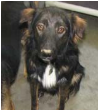
#2 Mason-Sponsored (Australian Shepherd Mixed )

"Hello. My name is Mason and I'm a sweet dog who came to the shelter with my three brothers. I had been here before, but I don't remember it cause my mom was pregnant with me and my other siblings at the time. We all got adopted, but somehow three of us have already made it back here!" Thank you to an anonymous donor, who sponsored a portion of Mason's adoption fee. Now he can go home at a reduced rate!